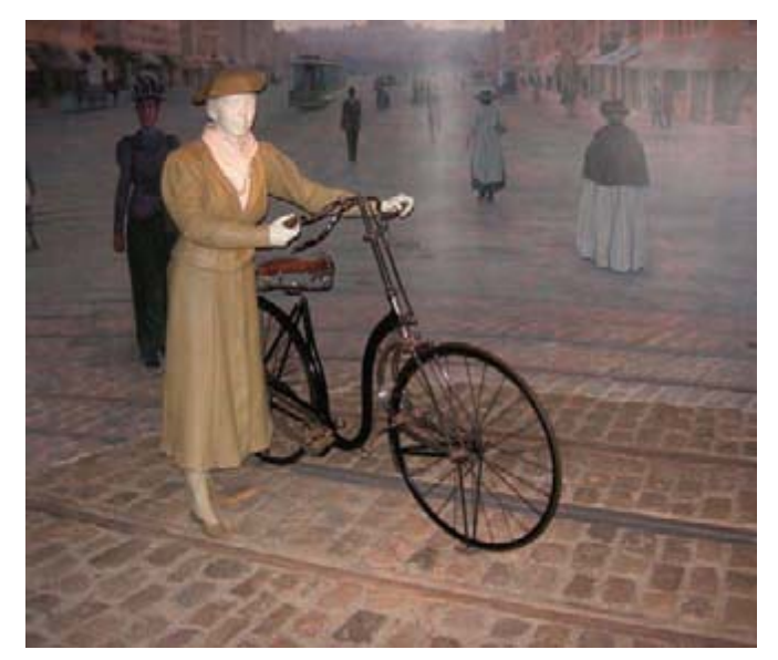
Image 4: The exhibition "On the Move" in the Museum of American History is one of the first exhibitions to include all modes of transport in one presentation.