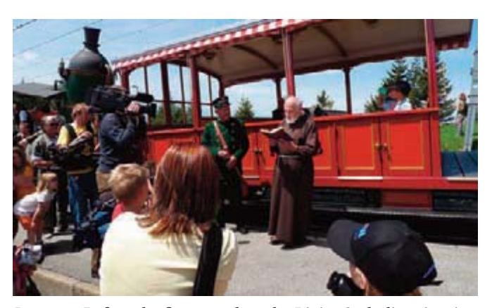
Image 1: Before the first travel on the Rigi a Catholic priest is blessing the restored passenger car. Running historical vehicles are a great attraction for a broad public.

In general, transport museums are mostly popular museums which appeal to a broader audience than the usual history or art museum which concentrated and still concentrate on an elitist audience with a university degree. Transport museums often show artefacts of mobility within the realm of the life experiences of their audiences and about a matter of everybody's concern. Most transport museums concentrate on the history of mobility in the age of industrialization. The artefacts, by their presence, evoke memories. The personal and emotional exhibition happens in the brain of the visitors. Besides telling a progressive history of success, these museums are important mediums talking about history. Many attempts have been made to enhance the importance of transport museums, but there is still a lot to do.