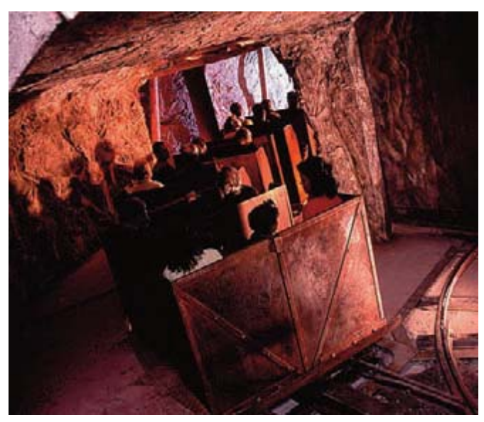
Image 3: The Gotthard tunnel exhibition in the Swiss Museum of Transport includes social and economic history. The show makes the visitors relive the building of the tunnel in the 19<sup>th</sup> century.

Shipping museums concentrate on preserving and showing ships. Often there is little interpretation about