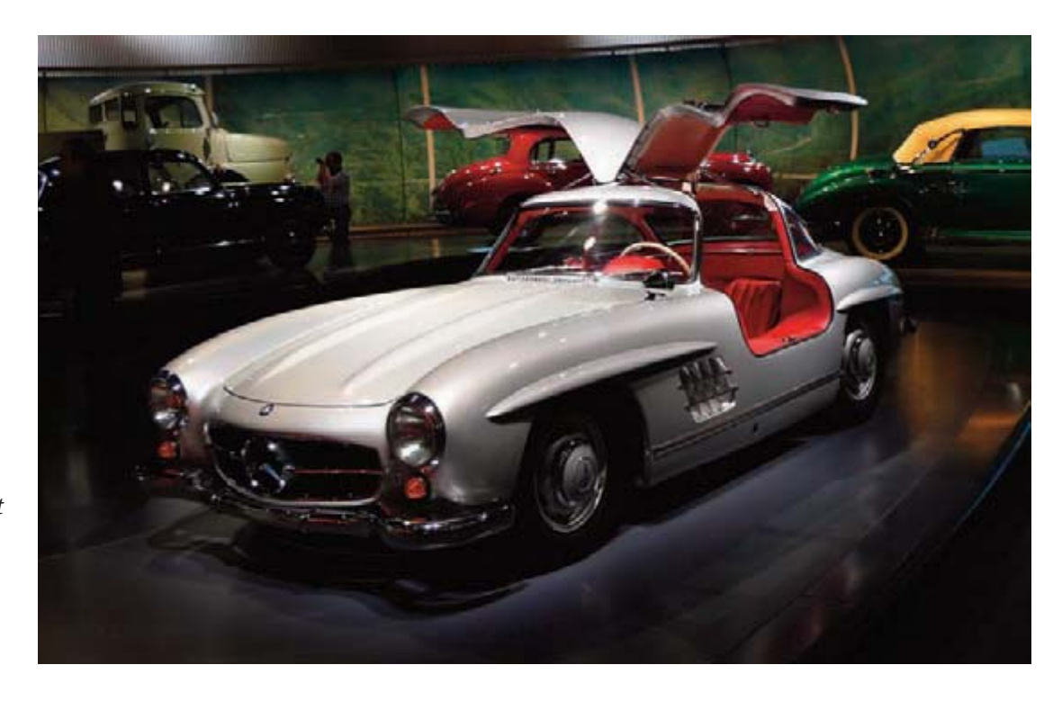
Image 6: The Mercedes Company Museum in Stuttgart shows the development of its cars and puts them in an historical context.

swers about the future but, through telling stories about the past, inspiring how future developments can be shaped. Within this framework museums don't have to stop promoting their long term duty of collecting. They have to do it by being relevant to today's society and not by showing artefacts and telling stories about museum work.