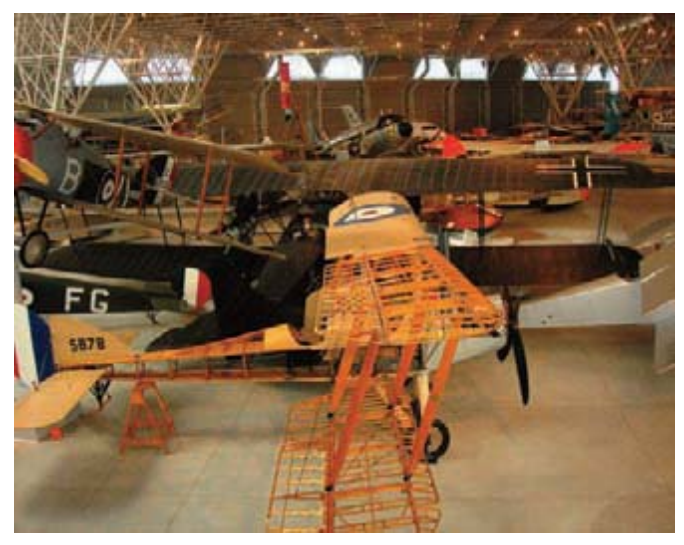
Image 5: The Canada Aviation Museum in Ottawa in the course of renewal. The new exhibition will include interpretation nodes which put the important aviation collection into an historical context. Credit Elsasser.

In conclusion, transport museums will have to concentrate on telling stories relating to the present. Artefacts will be important platforms for telling these stories but they aren't the means to do so by themselves. In words of the psychoanalyst and philosopher Erich Fromm, museums should concentrate more on being relevant than just having artefacts. For transport museums they have to concentrate on relating today's questions of mobility to historical developments. The role of the museum is not about giving an-